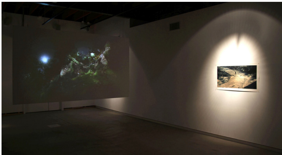
Hold (2010) Exhibition Detail (Eloise Calandre (2010) Cradle and David Mutch (2009-10) Untitled #10 ).

David Mutch's single photographic image Untitled #10 from The Tourist series (2009 - 2010) depicts a carefully framed landscape marked by deep shadows and a washed-out colour palette. The landscape provides a background on which a single figure walks along a desolate unsealed road. Just as Yardley's work suggests narratives beyond the frame, this image speaks of the road travelled and the road yet to be travelled. This presumed