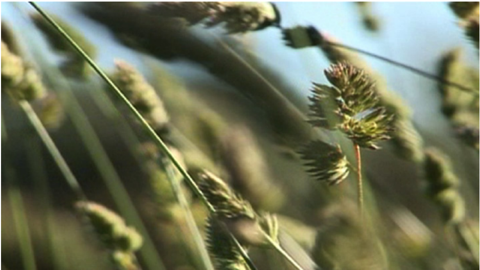
Scott Morrison (2009) oceanechoes , Video Still.

achieved through editing, rather than literally revealing the still image at cinema's base.