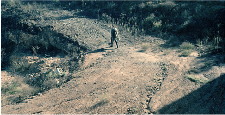
David Mutch (2009-10) Untitled #10 from the series The Tourist , Photograph.

narrative, evoked here in a photograph with a 16:9 cinematic ratio and carefully constructed aesthetic, suggests a cinematic freeze frame.