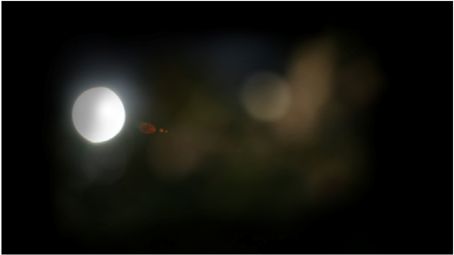
Eloise Calandre (2010) Cradle , Video Still.

movement of the camera's lens. This movement is specific to optical devices and is not possible to reproduce outside of this context. Although the change is produced through the movement of the camera lens, there is something specifically visual about this kinetic change. The effect is not only perceived visually, but it reproduces an effect of the human eye.