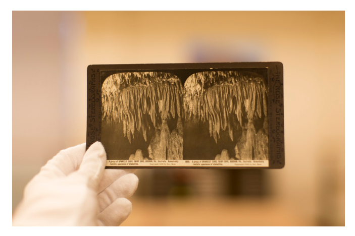
JESSICA HOOD | The Cave & the Archive: Elery Hamilton-Smith's stereograph collection, 2015 (detail). One-hundred and sixty-two 35mm colour transparencies, two Kodak Carousel projectors, ceramic coated glass, projector stands

Marchesi titles her works according to the day the scene occurred, creating a systemised order to the chaos of everyday life, and allowing these fleeting moments to be both recorded and compared. Produced in the early months of Marchesi's relocation from Australia to Germany, the works capture both the beauty of the everyday, and the way in which objects take on new significance amongst processes of dislocation. This series of paintings, a makeshift archive of a small detail in a new context, emphasises a single moment's continuity with, and subtle differences from, every other day and every other place.